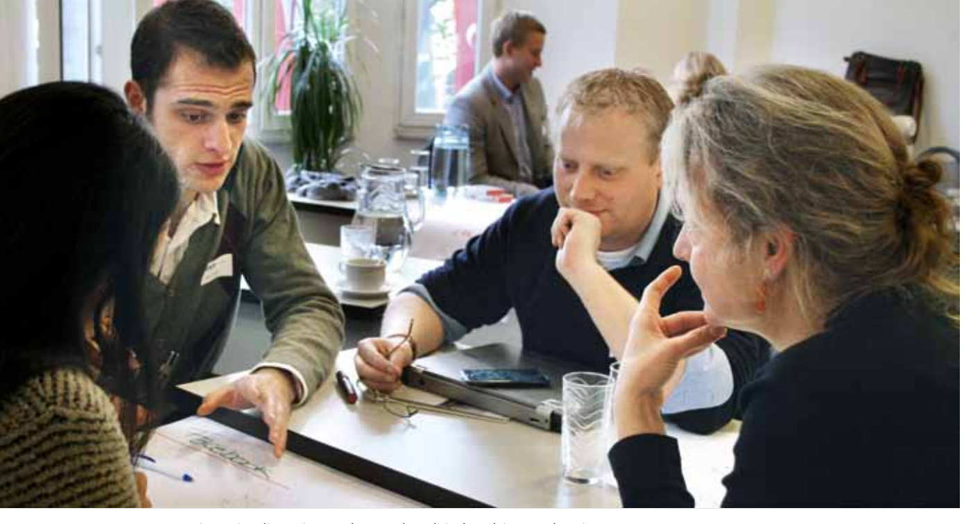
Intensive discussions on how to do political work in a rural environment