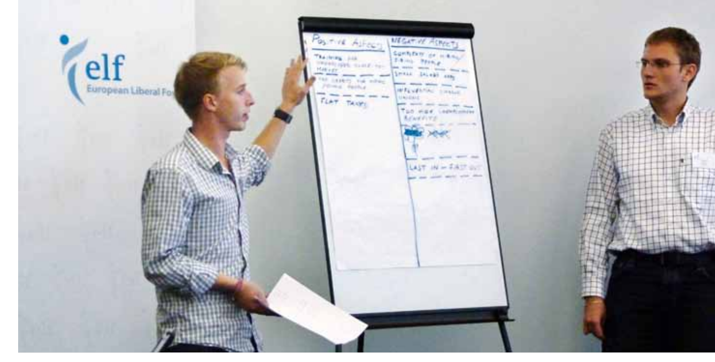
Debating the pros and cons of Flexicurity

Demographic change will drastically alter the societal balance between economically active and inactive individuals in Europe in the coming years and poses serious challenges for the creation of inter-generational fairness. Some of the biggest consequences of demographic change in Europe will be seen within the social insurance and healthcare systems, the labour market and social security systems and also within the greater political system.