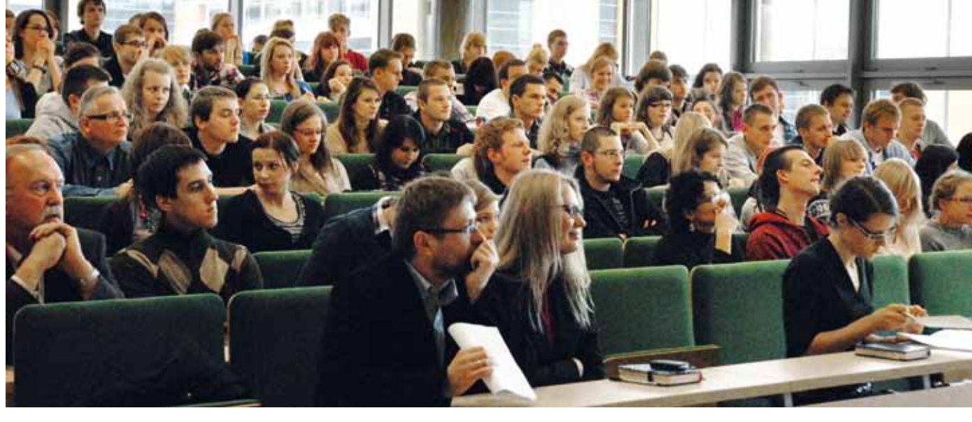
Audience gearing up for a discussion on the versatility of Liberal principles

The main conclusion from the debates is that there is a significant interest in Liberalism among Polish opinionmakers and young people. During the last four years of a Liberal-leaning government, which contrasted heavily with the former conservative administration, the word 'Liberal' ceased to be a stigma. As one of the newest political trends on the Polish political stage, Liberals are gathering more and more attention of the general public and the media. This is encouraging more people to take a strong position towards Liberals and Liberalism, and there is a growing arena for the discussion of Liberalism. Liberal proposals now exist freely and could be attractive even to those who would never have called themselves Liberals before and they may now find themselves able to support specific ideas presented by the Liberal movement if they are well argued. Polish society is definitely more open to a Liberal agenda now than ever. The debates were able to clearly demonstrate