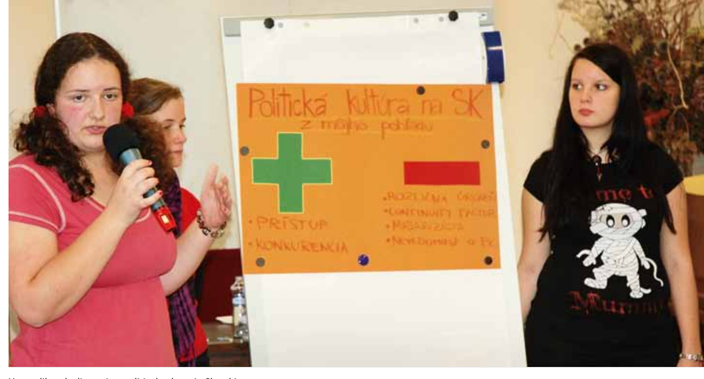
Young liberals discussing political culture in Slovakia

The subsequent sessions were dedicated to analysing two threats to political culture: corruption and the public's perception of it, focusing on the role of the media.