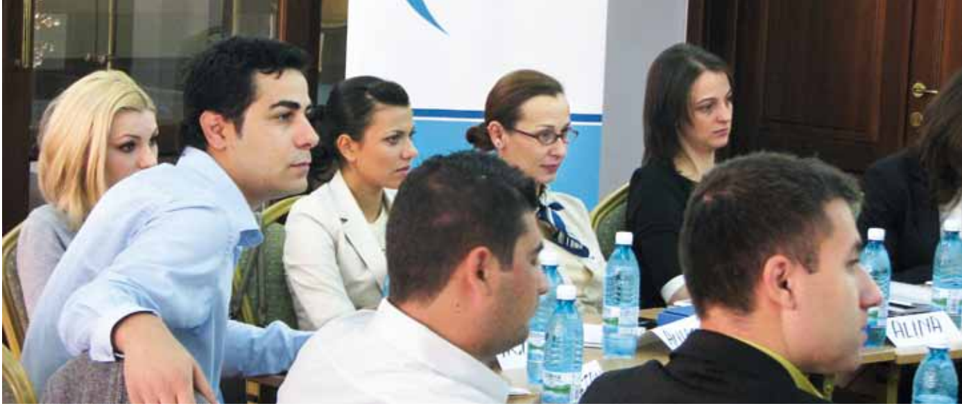
Young Romanians attentively following presentations on the EU and its institutions

The seminar's first exercise outlined the history of the EU, describing its development from inception to the present, emphasising the EU's fundamental institutions and underlining the decision-making process at EU level. The value-added aspect of this topic for the participants was their understanding of the fact that each member state, regardless of its size or wealth, and