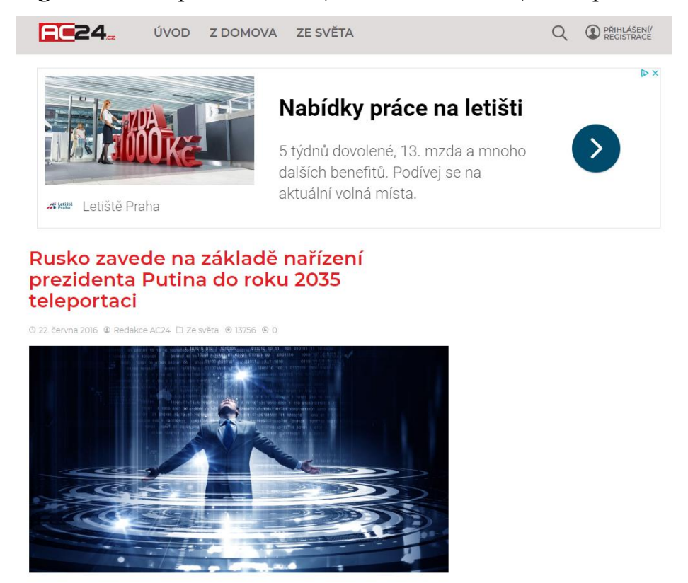
Figure 1: Article preview "Russia, on Putin's command, will implement teleportation in 2035"

There were observed (on 23 October 2019) 31 articles including the term "5G" on the AC24.cz website. The first article was published on 22 June 2016 (the website was established in 2011). The article has title: "Russia, on Putin's command, will implement teleportation in 2035."