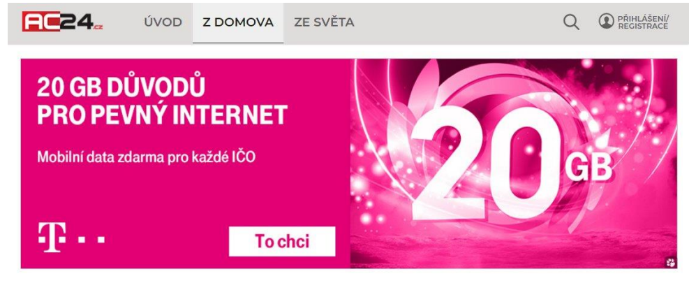
Figure 5: Advertisement of T-Mobile on AC24.cz next to the headline "5G has been coming. A journalist worried about his own health was silenced. What can 5G cause?"

5G přichází. Reportéra, co měl obavy o zdraví, umlčeli. Co může způsobit?