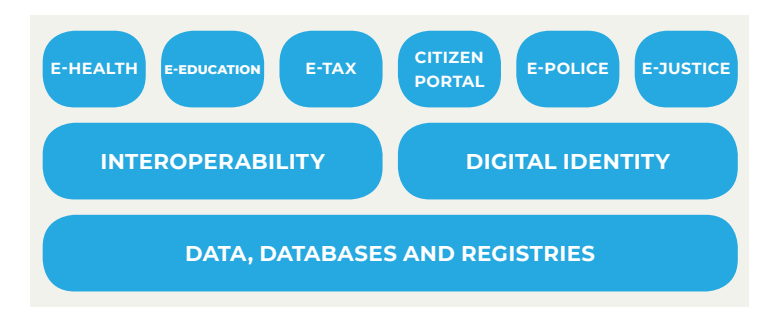
Figure 2 A conceptual architecture, key functional enablers of e-governance